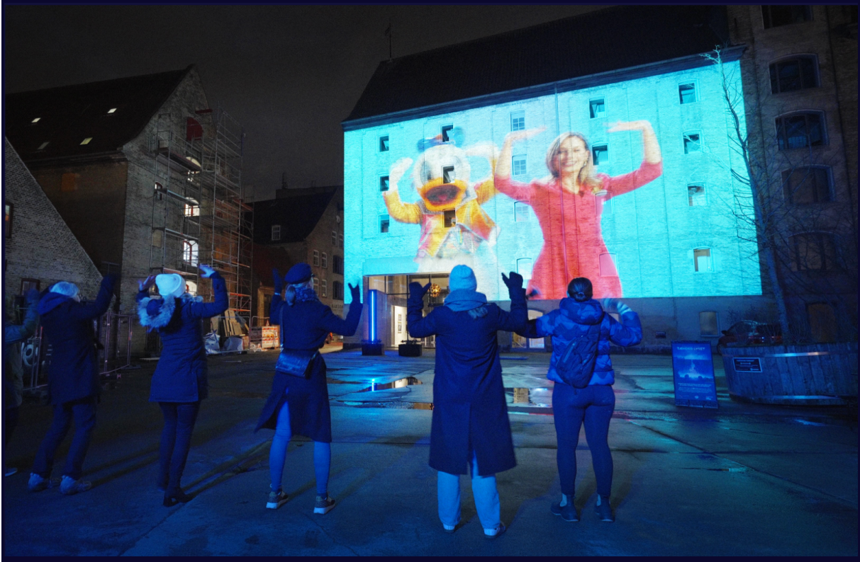
The Castle by Disneyland Paris