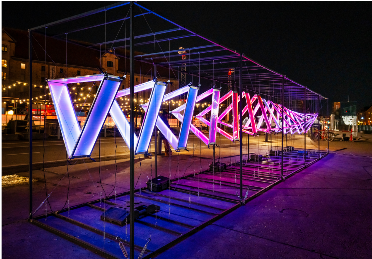
ECHO by Julien Menzel

More than 55 light installations are featured in this year's Copenhagen Light Festival. The installations will illuminate the winter holiday month, up until the 26th of February. 13 of the installations will stay on even longer.