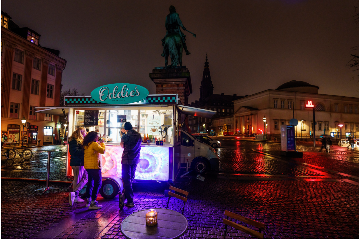
The festival-themed beverage wagon. "From here to Eternity", light design by Arthur van der Zaag Here you can collect your treasure hunt reward, once you've found 25 light installations.