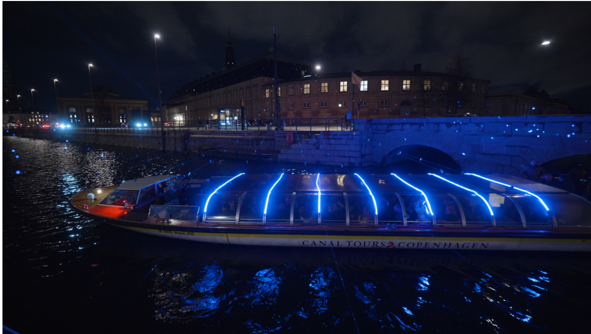
Experience the canals and the light festival with a guide.

Guided tours have been popular in recent editions of the festival. This year we've expanded tour-opportunities to include beer-, wine-, and dance-themed tours, as well as tours offered by Canal Tours, that'll show you the light festival from the vantage point of Copenhagen's classic canals.